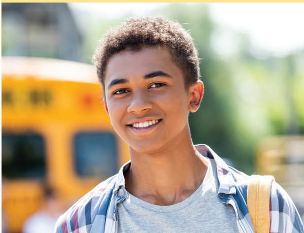
Individuals pictured are models used for illustrative purposes only.

“My son and I were a little scared when we came here. Staff did an amazing job at explaining everything. Edgewood definitely helped us because the staff were so transparent. This was really refreshing and comforting and made this already heightened situation much easier to handle.”